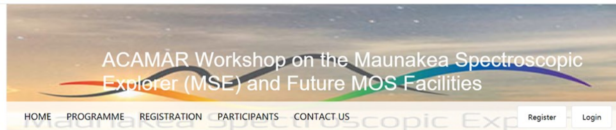
Website for the ACAMAR workshop