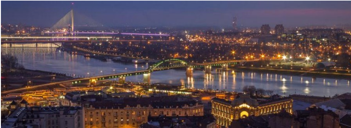
Venue for the 13th Serbian Conference on Spectral Line Shapes in Astrophysics, the Faculty of Mechanical Engineering in Belgrade