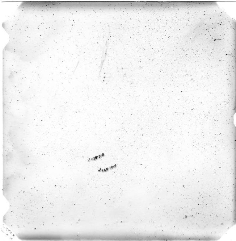
Fig. 3. Scanned photographic plate (from the very early datasets).