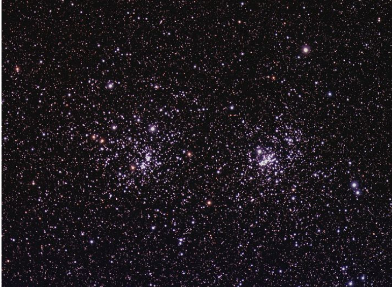
Figure 1: On left - h Persei, on right - \chi Persei. North is UP, East – to the left.

The existence of star cluster pairs in our neighboring galaxies - Magellanic Clouds is established from several authors: Bhatia and Hatzidimitriou (1988); Vallenari et al. (1998); Dieball and Grebel (2000); de Oliveira et al. (2000). Dieball (2002) proposed a catalog of binary and multiple cluster candidates in the Large Magellanic Cloud with 473 members. Amongst the more than 1600 open clusters in our Galaxy only one is well established double or binary cluster - h & \chi Persei (NGC 869 and NGC 884), Fig. 1 . Our Galaxy seems to show a lack of binary or multiple clusters when compared with the Magellanic Clouds. Whether this apparent lack of binary clusters in the Galaxy is real or not is a subject to discussion and several lists of binary open clusters candidates are proposed and studied by various authors: Lynga and Wramdemark (1984); Pavlovskaya and Filippova (1989); Tiganelli et al. (1990); Subramaniam et al. (1995); Loktin (1997); Muminov et al. (2000). One of the most complete and well studied list is the one of Subramaniam et al. (1995) with 18 candidates pairs, including the clusters NGC 1907 and NGC 1912 – see Fig. 2 (Kopchev and Petrov, 2006).